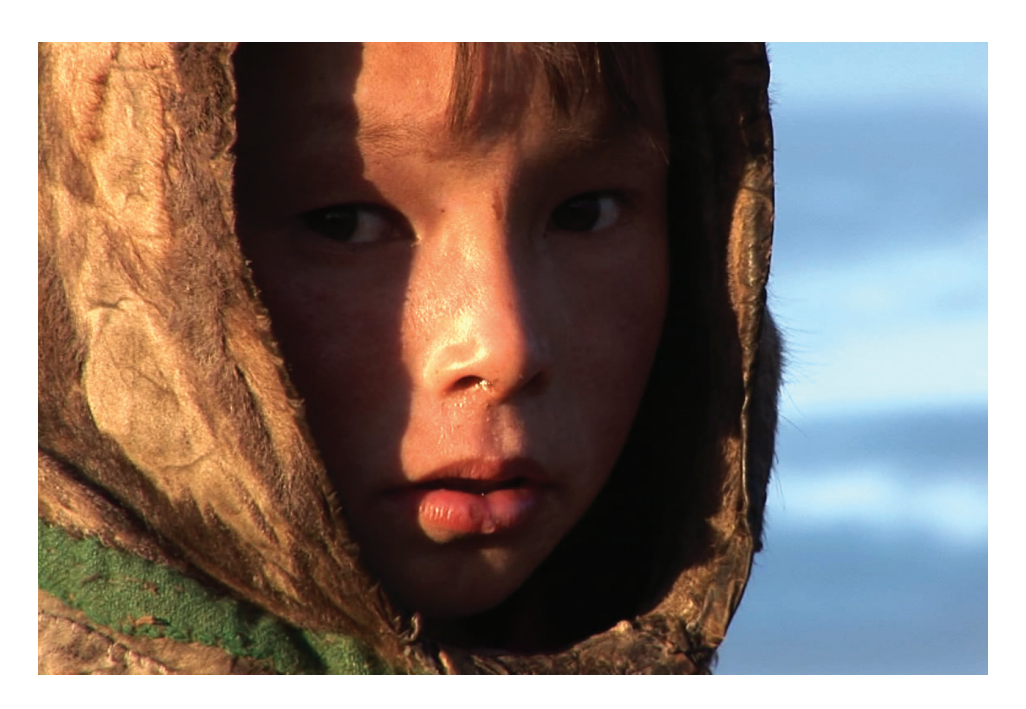
FOR TICKETS AND MORE INFORMATION VISIT WWW.IHOUSEPHILLY.ORG/RUSSIA Free admission for IHP members; $7 students + seniors; $9 general admission.